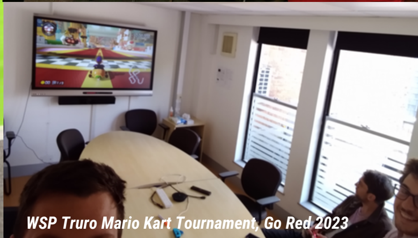
WSP Truro Mario Kart Tournament, Go Red 2023