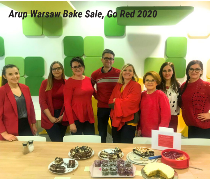
Arup Warsaw Bake Sale, Go Red 2020