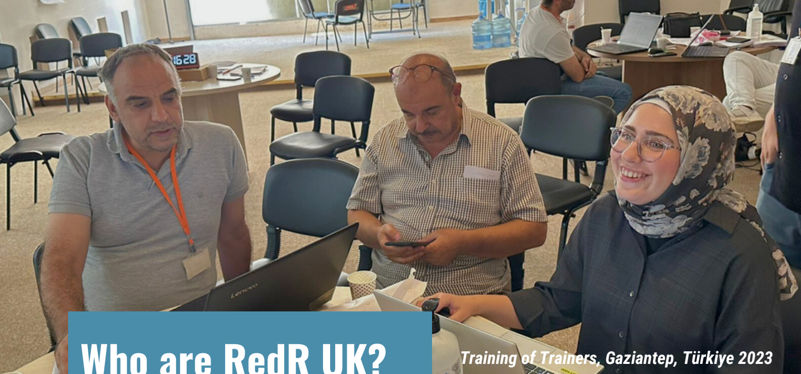
Training of Trainers, Gaziantep, Türkiye 2023