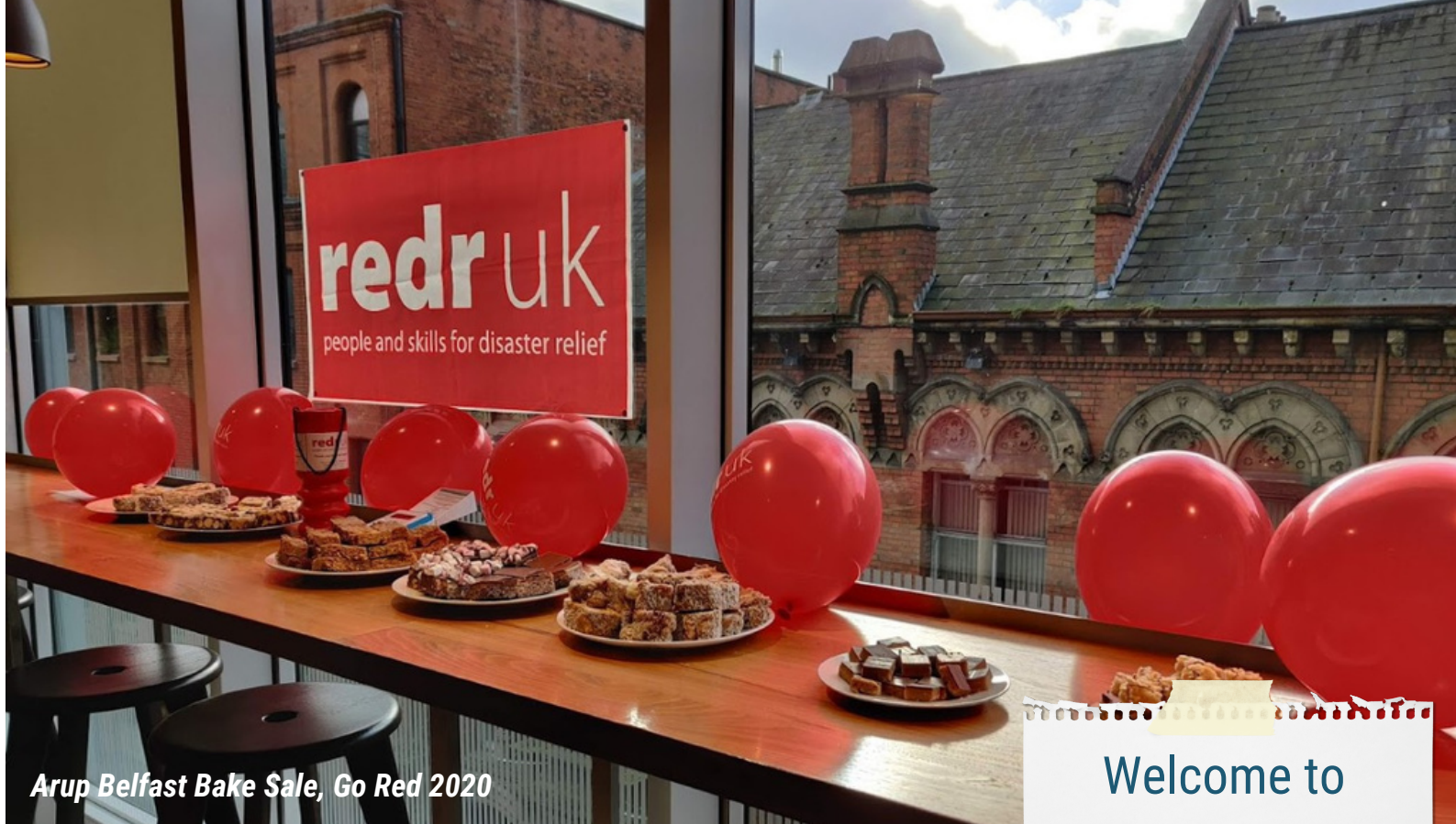
Arup Belfast Bake Sale, Go Red 2020