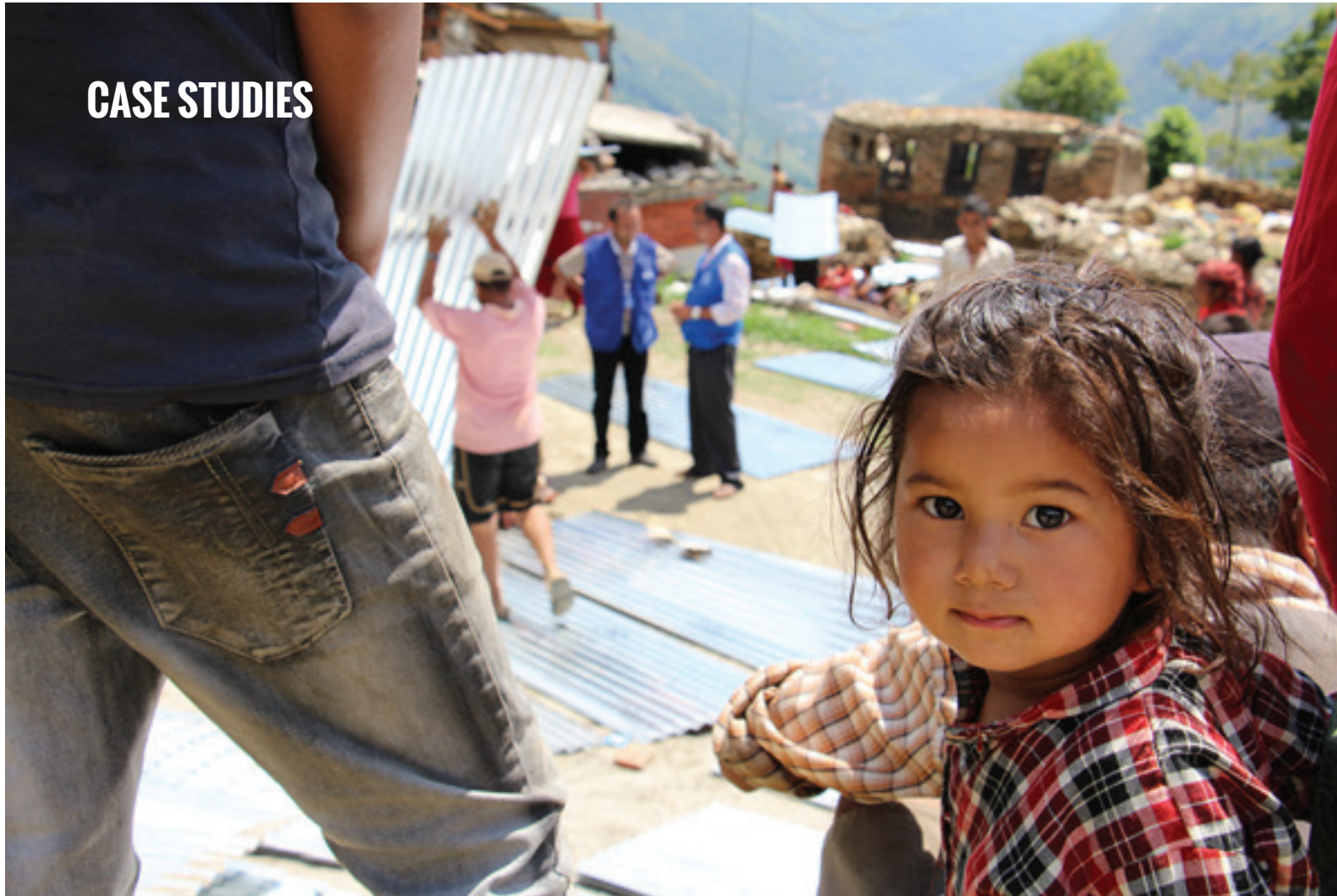
The IOM distributes emergency shelter to affected communities in Barabise, Sindhupalchok District, in June 2015